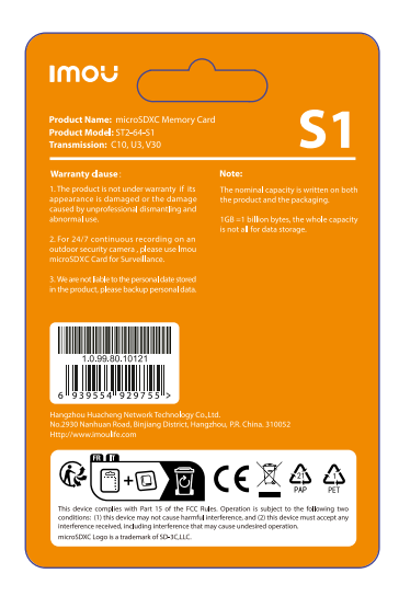
Back of the package